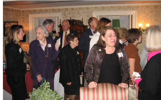
The party in full swing!